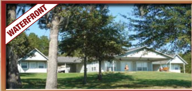
GREAT waterfront! 6.5 ac on open water w/220+ LF of bulkhead & boathouse. Metal/wrkshp barn on slab. 2/2 main home. Granite counters, tile floors. 2 guest cottages. REB# 9775180. $515,000