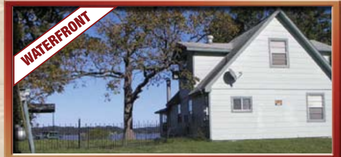
THIS 3/2 HOME offers 172' of waterfront & a great waterview from front of the home. With a little TLC this home will make a great lake home or lease property. New bulkhead. REB# 38494508. $222,000