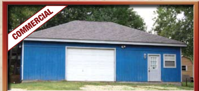
GREAT office space wired for hi-speed internet, fax & phone. 2 lg rms, laminate flrs & half bath. 300+ SF add'l build out space avail. Fenced equipment yard w/gate, 2 lots. REB# 18539611. $85,000