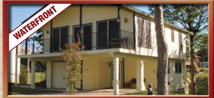
PRISTINE 4/2. Completely remodeled, solid surface counters, new appl's, paint & carpet. Waterview front & waterfront back. Boat-house, bulkhead. 2/1 down and 2/1 up. REB# 77257904. $249,900