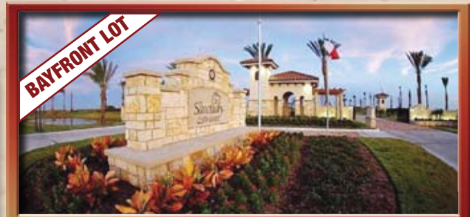
NOWHERE ELSE in TX will you find this living experience. Welcome to The Sanctuary at Costa Grande, a resort comm. Interior bay view lot. Ready for your dream home. REB# 70636234. $139,900