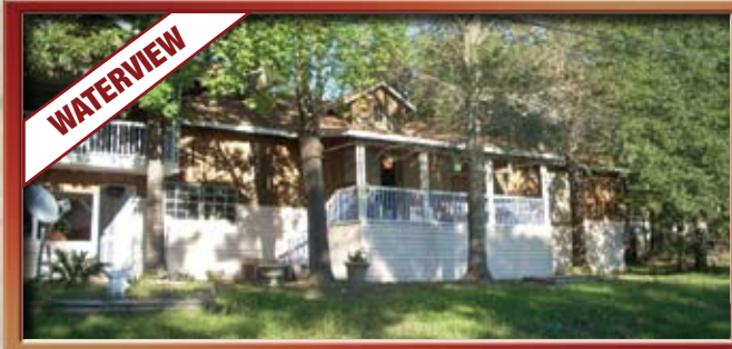
NICE, LARGE , waterview home. Private mstr/sitting room up with garden tub & balcony. Kitchen w/tons of counters, living rm, balcony with view. Across street from boat ramp. REB# 31164245. $196,000